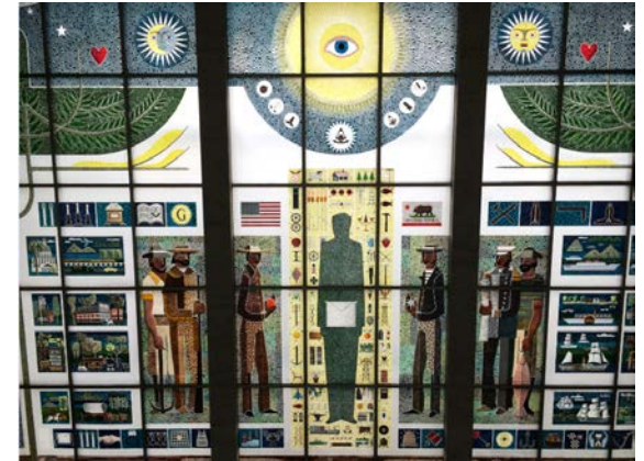
Masonic Mural at The Grand Lodge of California

The history of Masonry in California is inseparable from the history of the state. The endomosaic mural celebrates Freemasonry's role in the development of California. The history falls into two categories: the wayfarers to the left and the seafarers to the right. The central figure represents the modern Mason and the symbols seen throughout represent Masonic principles, the three primary degrees of Masonry, and the fraternity's link to ancient stonemasons and architecture.