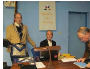
"Well Wishes" cards are signed by the lodge for 10 adopted residents of Whitestone.