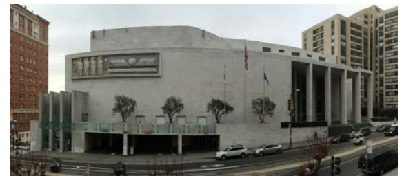
The Grand Lodge of California San Francisco, California

Please send the lodge your 2014 dues as this is our main revenue stream to keep the lodge running. If you received one by accident, just email or call the secretary.